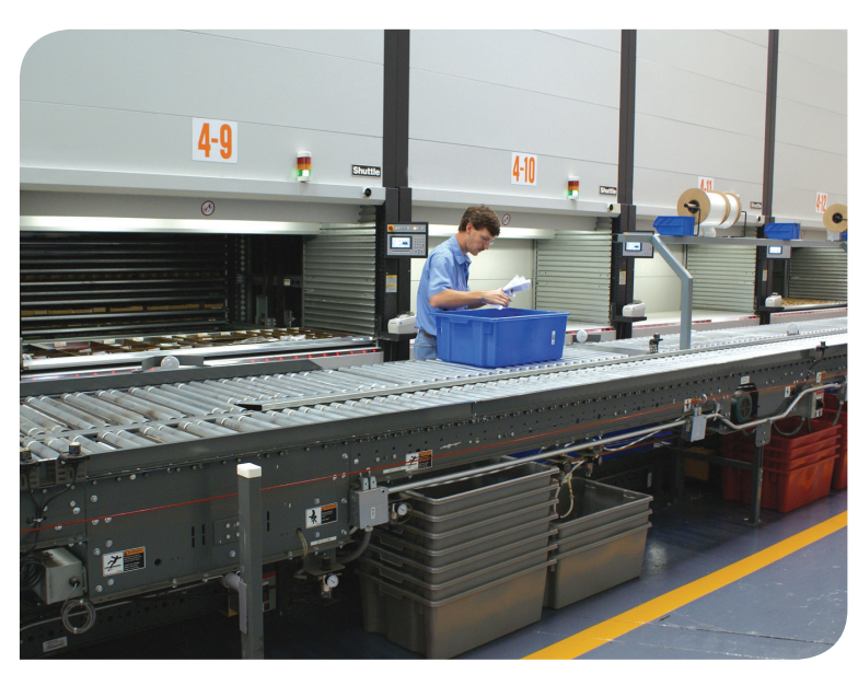
Tracking the order though the system allows Mazak to make real time changes.

Mazak's newly automated North American parts center in Kentucky, with its streamlined automation capability, is another indicator of the company's desire to provide its broad base of customers with superior support and service.